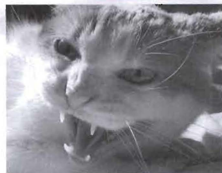
Cat's sharp teeth can inflict puncture wounds requiring aggressive medical care.

◆ Heed early attack signs. Common signs include tail lashing, ear flicking, dilated pupils, tensing muscles and hissing. That's your cue to stop interacting with your cat. Be alert to redirected aggression. Your cat may look out the win-