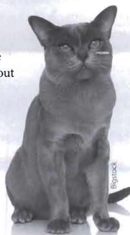
While any cat can develop diabetes, Burmese seem more susceptible to it.

What's more, advances in diet in recent years have made it possible for some otherwise-healthy cats to