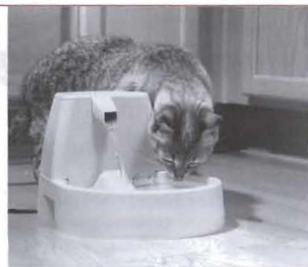
Cats seem attracted to fountains' moving water.

Do regular "hydration checks" by gently pinching the loose skin at the nape of the neck, then releasing it. If it springs back, your cat is sufficiently hydrated. If it remains "tented," then settles slowly, consult with his veterinarian promptly.