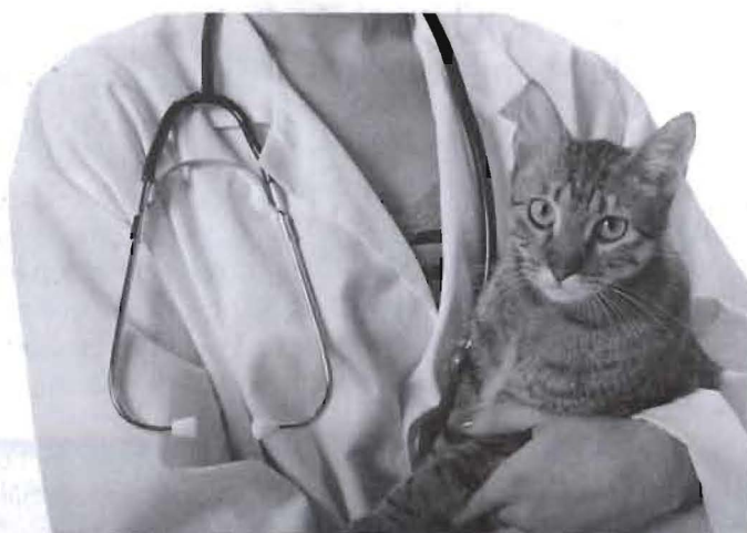
The maximum interval between veterinary visits for diabetics should be three months to uncover problems that may go unnoticed at home — cats skillfully hide illness.